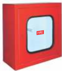
MS Cabinet Single Door