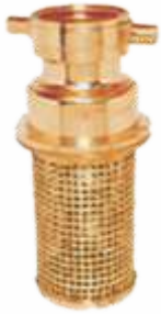
Foot Valve Strainer