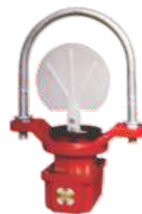
Water Flow Indicator