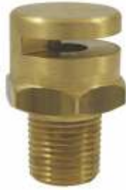
Water Curtain Nozzle Brass