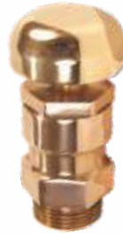
Gun Metal Air Release Valve