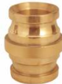
Double Male Adapter