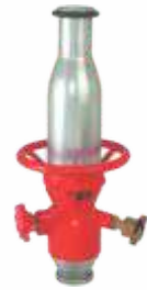
FB - 5X