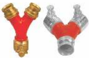
Gun Metal & Aluminum Dividing Breeching