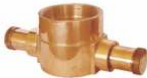
Adapter Double Female Lugs