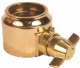
with Butterfly Lugs Gun Metal Adapter