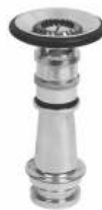
Triple Purpose Nozzle