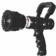
Multi Purpose Nozzle