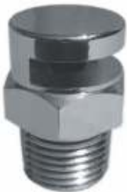
Water Curtain Nozzle Stainless Steel