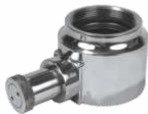
Stainless Steel Adapter