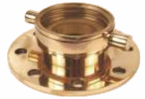
Gun Metal Draw of Connection