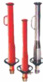
FX - 10X