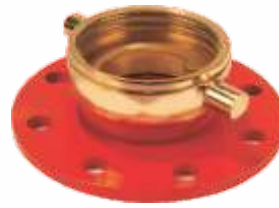
C.I. Draw of Connection