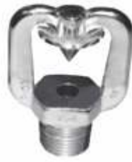
Sprinkler MV Spray Nozzle