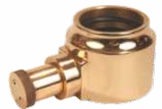
Gun Metal Adapter