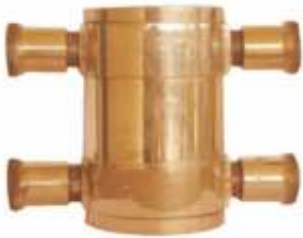
Double Female Adapter