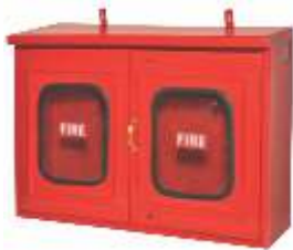
MS Cabinet Double Door